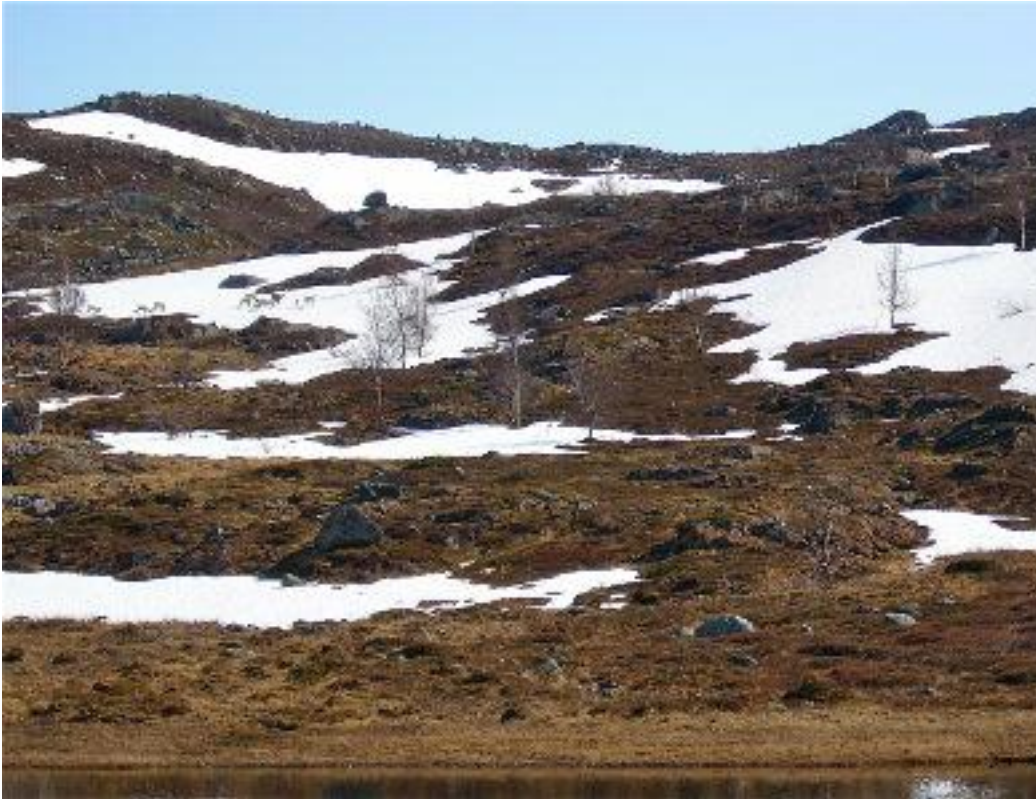
Reindeer grazing on the Nussir mountain in Kvalsund, reindeer herding district 22 Fiettar. The reindeer herders in this area have been exposed to and threatened by development of hydropower, wind power, cabin development and power lines.

lines, leading to piecemeal loss of land and grazing areas. Wind power is in a league of its own in this matter, executing pressure for a pace and scale of development by wind power companies and authorities that is without comparison historically.