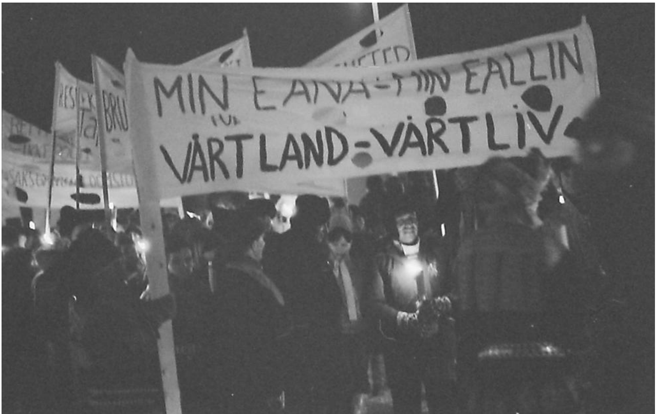
Sámi demonstration against the building of the dam in Alta, 13.01.1981. Almost 40 years have passed, but the state still won't recognize Sámi people's rights to stop interventions in nature.

Norway's constitution says in §108: "It is the state authority's responsibility to facilitate that the Sámi people can secure and develop its language, its culture and community." Norway has ratified the UN conventions about civil and political rights, about biological diversity and against racial discrimination, as well as the ILO-convention about indigenous peoples, and joined UN's declaration about indigenous people's rights. These documents tells that indigenous peoples have a right to protection of their culture and the nature which is the base of the culture. These are commitments to which Norwegian authorities are both morally and legally bound.