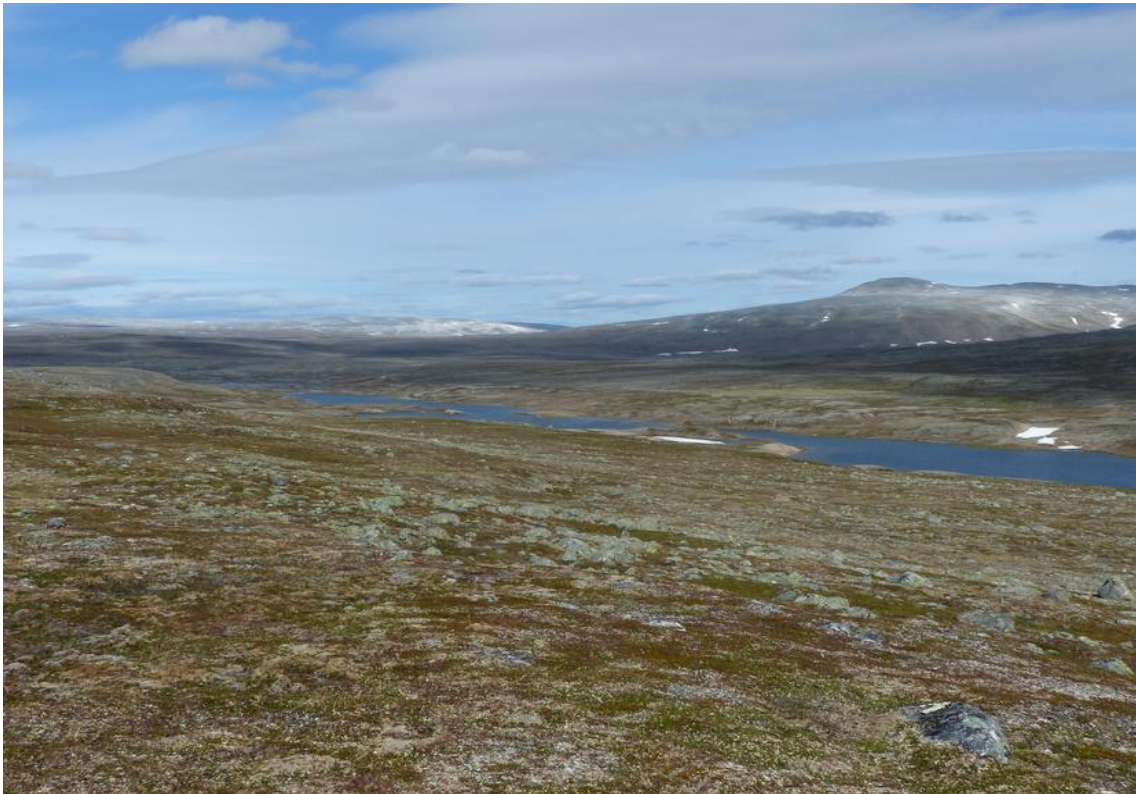
Part of the planning area for Davvi wind power plant, in Lebesby (Davvesiida) / Tana (Deatnu) municipalities in Finnmark. On the right is the mountain Rásttigáisseaibbuš, and in the middle the mountain Vilgesrášša. Construction of wind turbines is planned from the centre of the image towards the horizon on the left side.

In recent years we have seen an explosion of interest in new wind power projects, encouraged by incentives from a Norwegian-Swedish support scheme called “green certificates”. Roughly half of the wind power initiatives have been in areas with reindeer husbandry, causing conflicts on both sides of the border.