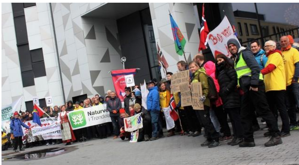
Influencers demonstrated against wind power plans outside Trønderenergi 13.05.2019. Behind the demonstration were a number of environmental organizations and Sámi organizations.

Both overall decisions on wind power development and licenses for certain wind power plants are influenced by a number of press groups. Who has been in favour of and against wind power development has largely changed over the last couple of decades.