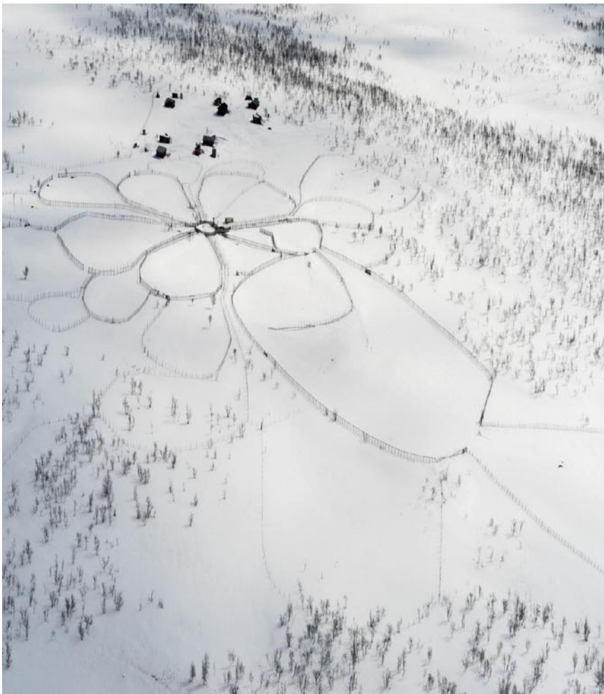
Herding fence for separating reindeer, Sohparvådda, Karasjok

There is a great lack of knowledge about reindeer husbandry in Norwegian society, and this is one of the reasons why reindeer husbandry interests often are not respected in cases of nature intervention in reindeer grazing areas. To consider such interventions, we must look at all aspects of reindeer husbandry.