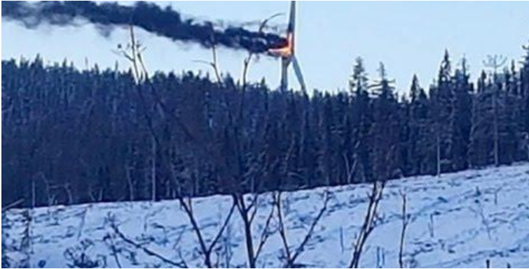
Burning wind turbine, Bösjövarden, Mora, Sverige, 23.02.2020.