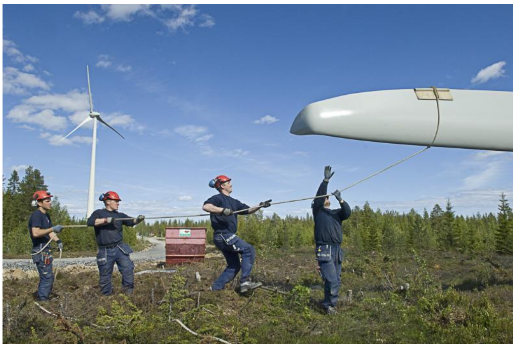
German installers building wind power plant in Granberget, Robertsfors, Sweden.

The development of wind power in Norway and Sweden has taken place in close collaboration, among others on green certificates. Sweden has built and is building a lot of wind power on reindeer grazing land.