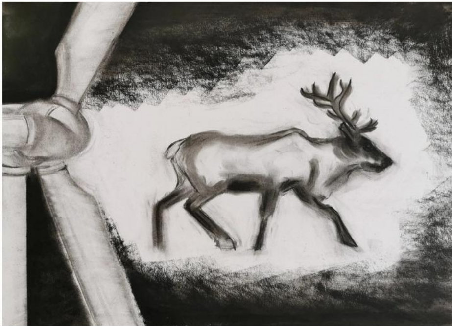
Illustration: Christina Fieldavli

This development and rapid expansion of wind power projects, occurred with such speed and intensity that neither reindeer herders nor other affected parties were prepared for how much and how quickly pasture would be lost.